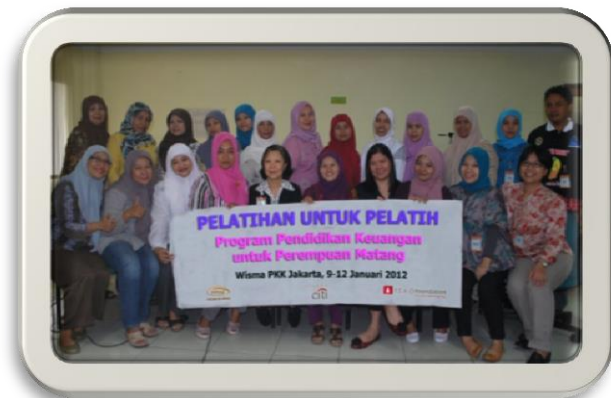
Training of Trainers, 2012