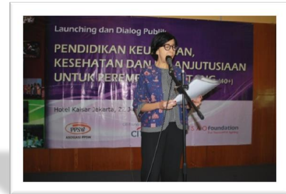
Program Launched, 2011