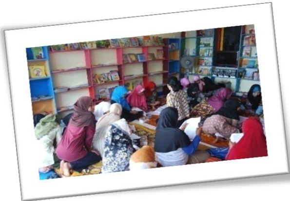
Need Assessment among 350 Members of Association PPSW with Center of Ageing UI. 2011