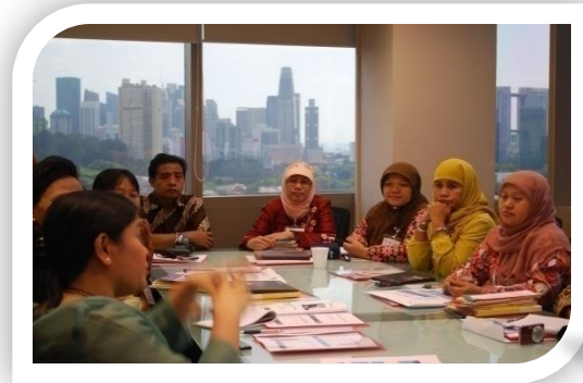
Study Visit to Tsao Foundation, 2011